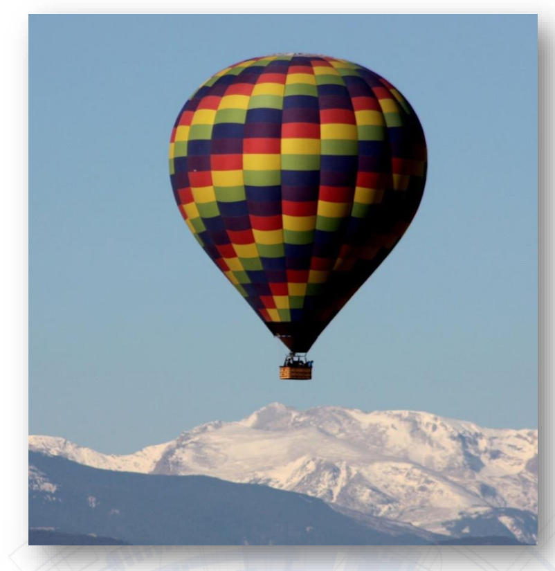
Don't let your BD be a balloon ride